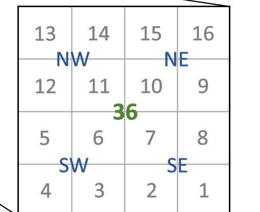
SECTION DIAGRAM WITH LEGAL SUB-DIVISIONS